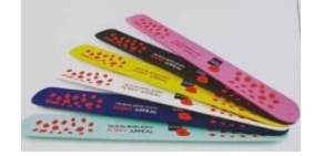
Snap Band – suggested donation £1.50