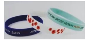
Wristband – suggested donation £1