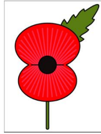
Paper Poppies – any donation