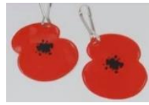
Zip Pulls and Reflectors – suggested donation 50p